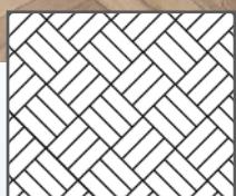
Diagonal Basket Wave